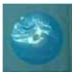
CD of instruction